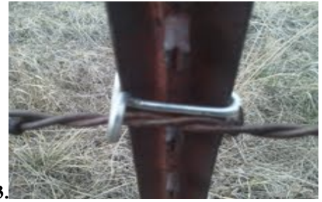
3. Snap tight to face of T Post