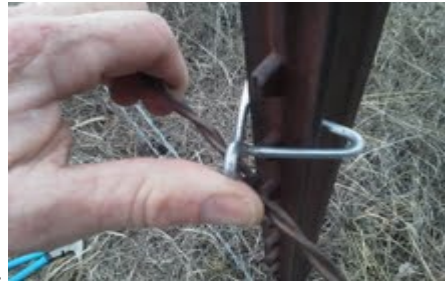
2. Catch side of T Post