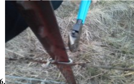
6. Continue around back of T Post