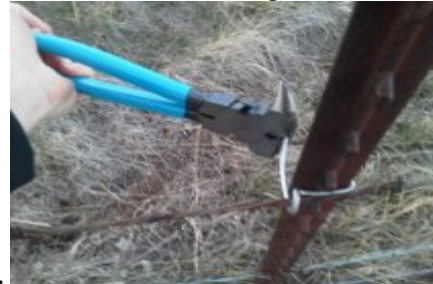
4. Grab tail end of Staple