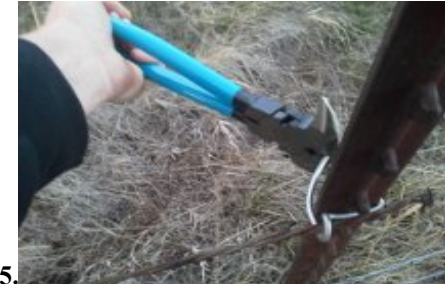
5. Push around back of T Post